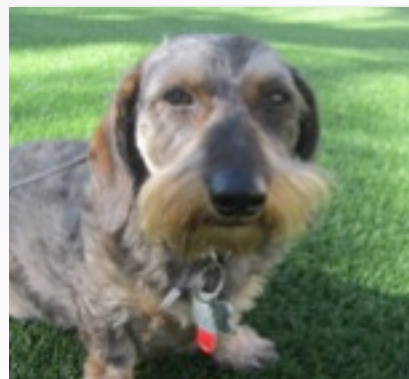
ORVILLE AT EYE LEVEL