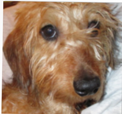
HAROLD SALTZMAN, 27 MONTHS