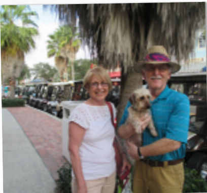
THE VILLAGES PLUS GOLF CARTS