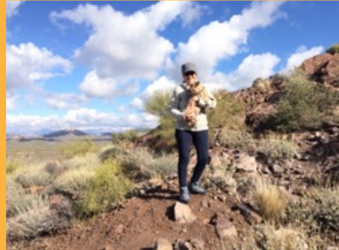
Superstition Mt. Climb